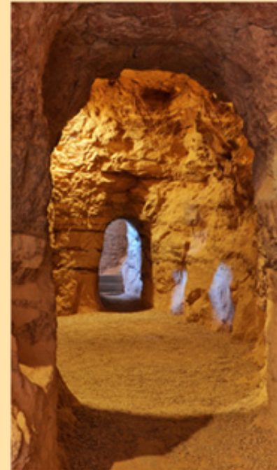
Image of the month "Manitou Cliff Dwellings" Theme was "Stones" Critic's Choice